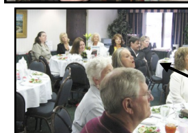
Attendees listen to a speaker and updates from the local CVBs at monthly luncheon meetings.