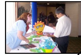
Annual Allied Member Showcase