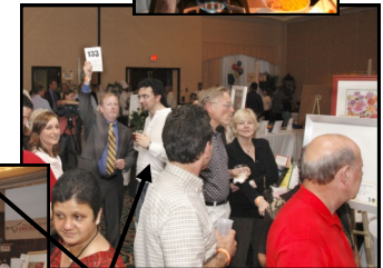
Food and fun for a good cause at the TASTE Culinary Sampling and Silent Auction